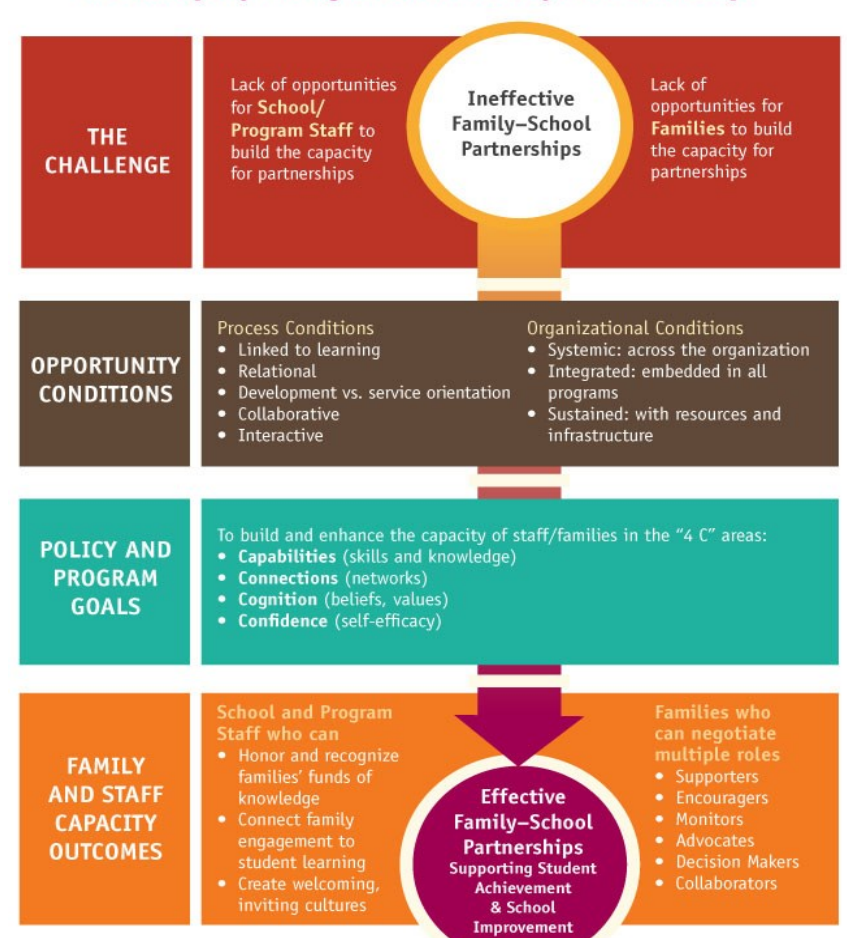
The Dual Capacity-Building Framework for Family-School Partnerships